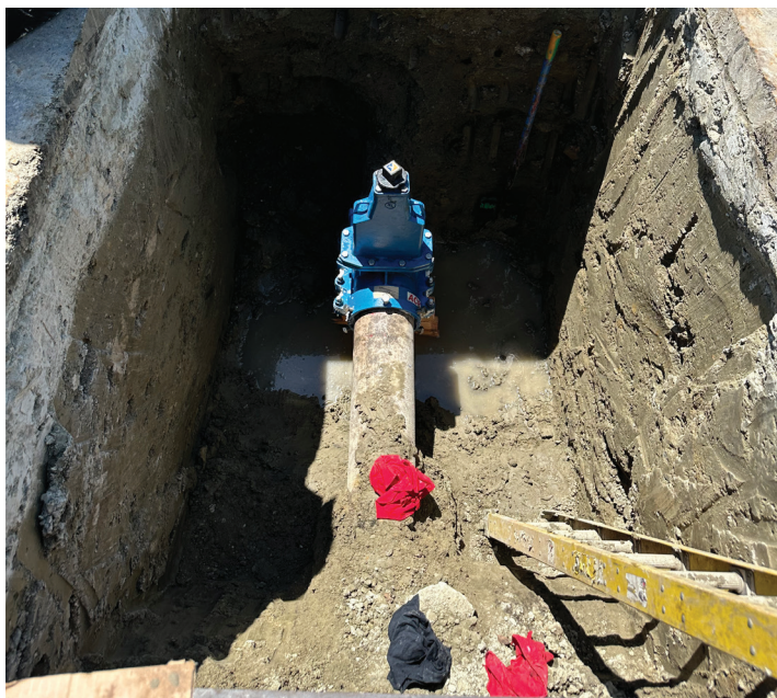
AVT EZ Valve installation complete with bonnet in place

Advanced Valve Technologies (AVT) is part of ClockSpring|NRI, the high-performance critical infrastructure solutions company. AVT's advanced solutions are based on simple designs that minimize risk to the environment and reduce costly downtime. Our primary focus is on disruptions in water service that cost providers money and leave end users without service.