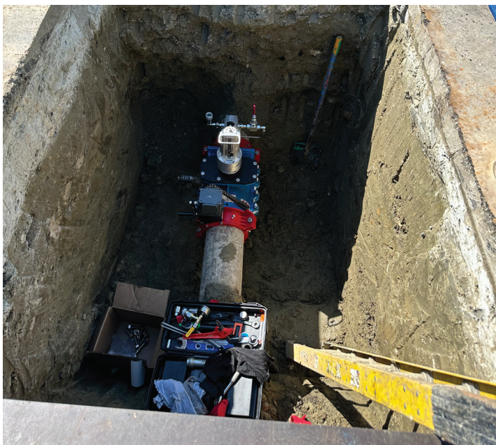
EM (end milling) machine in place and ready to mill a 120° across the pipe