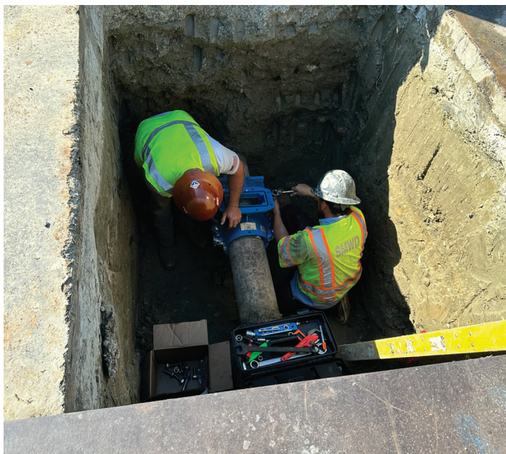
Valve body installed on pipe