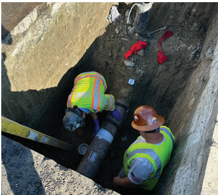
Pipe cleaned with tape and grease added ready to receive the gasket