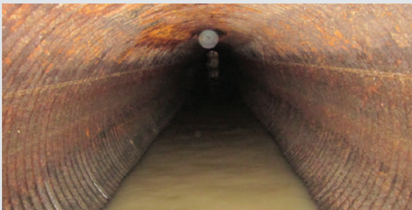
Severely deteriorated 130-foot CMP.