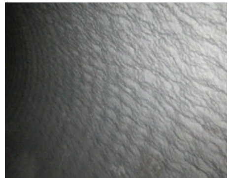
Close up view of sprayed geopolymer liner.