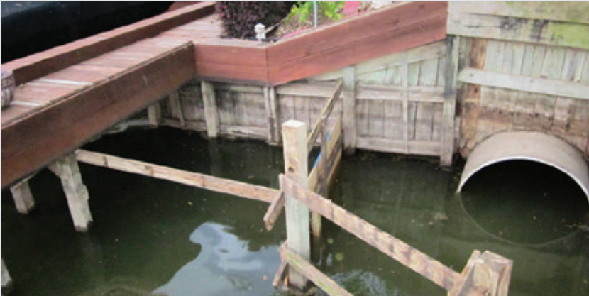
Outfall pipe, ending in Lake Conroe, was collapsed and replaced.