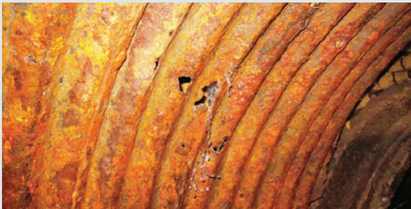
Heavy corrosion and infiltration within the pipe.