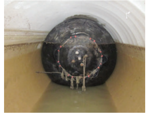
Outfall was plugged to prevent inflow of water from the lake.